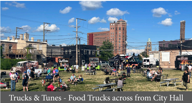
Trucks & Tunes - Food Trucks across from City Hall

Additionally, recent photographs of the city were taken to compliment this information and data, and to help capture the essence of what makes Rockford unique and attractive to so many residents and visitors alike.